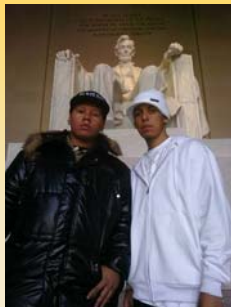
Federation of Families Conference Washington, D.C. December 2009