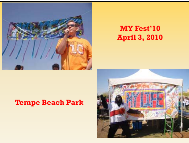
MY Fest'10 April 3, 2010