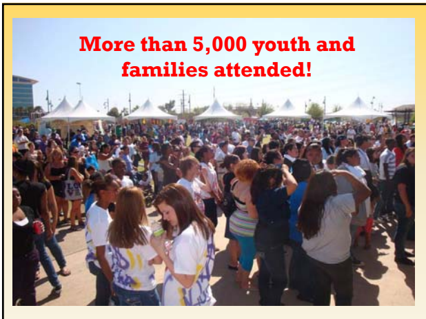
More than 5,000 youth and families attended!